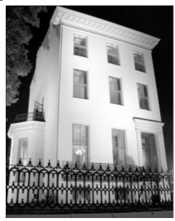
Campbell House Courier

(right) New exterior lighting helps the Museum's buildings shine in the evening hours.