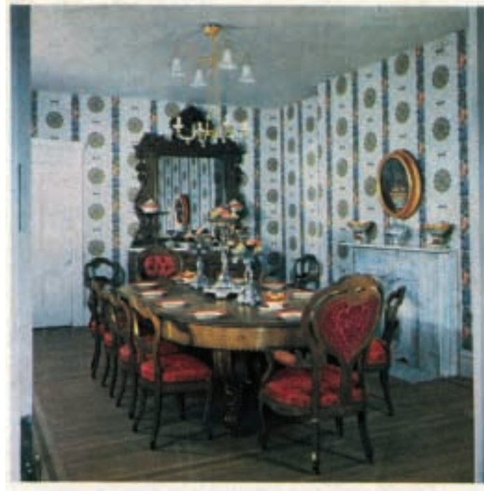
(top) "Group Seeking Way to Keep the Old Campbell House Intact", Thursday Evening, February 13, 1941, St. Louis Star-Times.