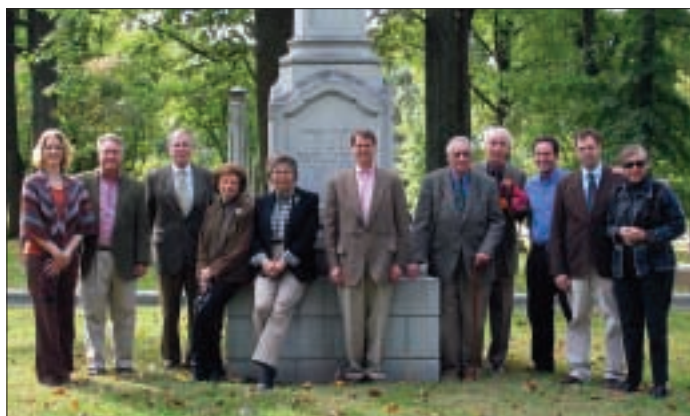
The Board of Directors at the Campbell family gravesite.