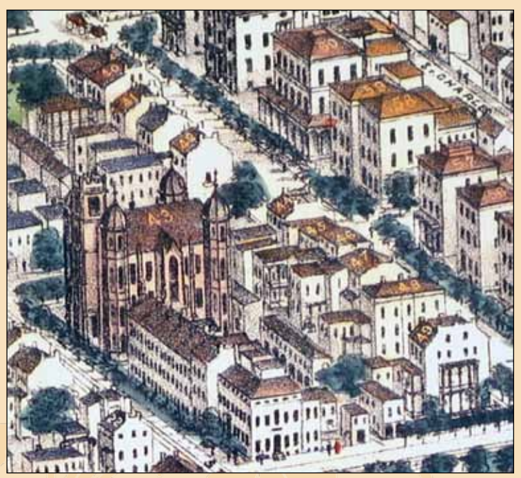
Above: Bird's-eye-view of part of Lucas Place in 1875, showing St. Louis' first public high school—as the only one in town for 30 years it was simply called High School.

Campbell House is proud to announce the return of this exclusive holiday tour of downtown sites including the Old Courthouse, Eugene Field House, Chatillon-DeMenil Mansion, and Cupples House. Tour features light refreshments, space is limited and reservations are required. $35 for tours and charter bus transportation between the four sites and $25 for a self-guided evening. Above: Campbell House parlor Christmas tree .