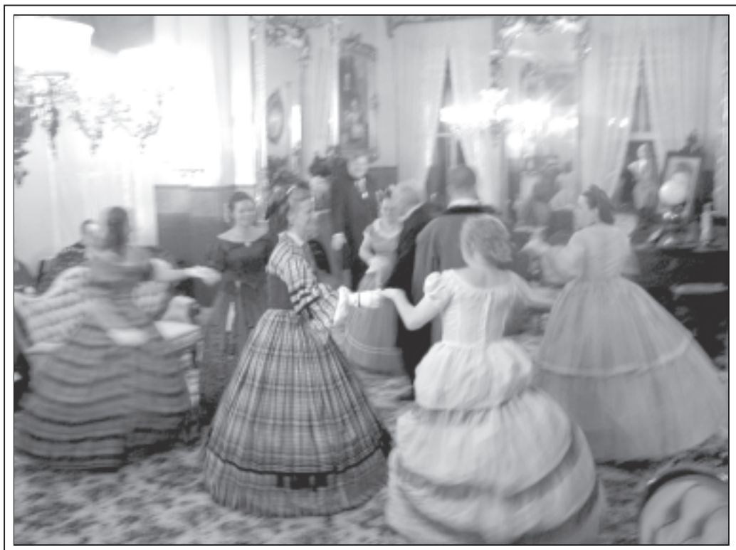
Members of the Royal Lancers dance company perform period dances in the Campbell parlor as part of the performance of The Campbells of St. Louis on November 26.