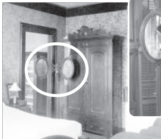
Mirror (circled) as it appeared in the Campbell House album, about 1885.